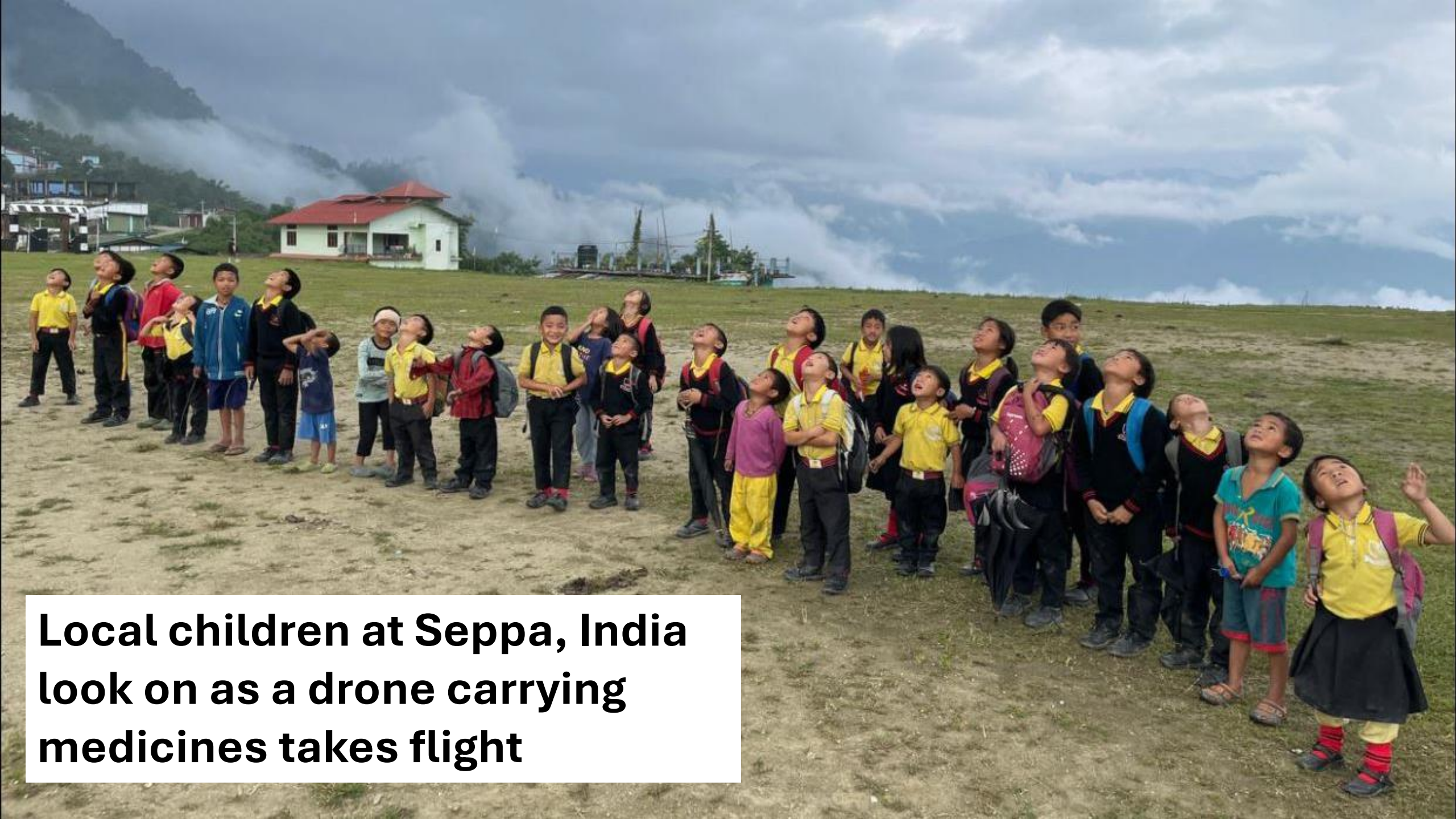
Local children at Seppa, India look on as a drone carrying medicines takes flight