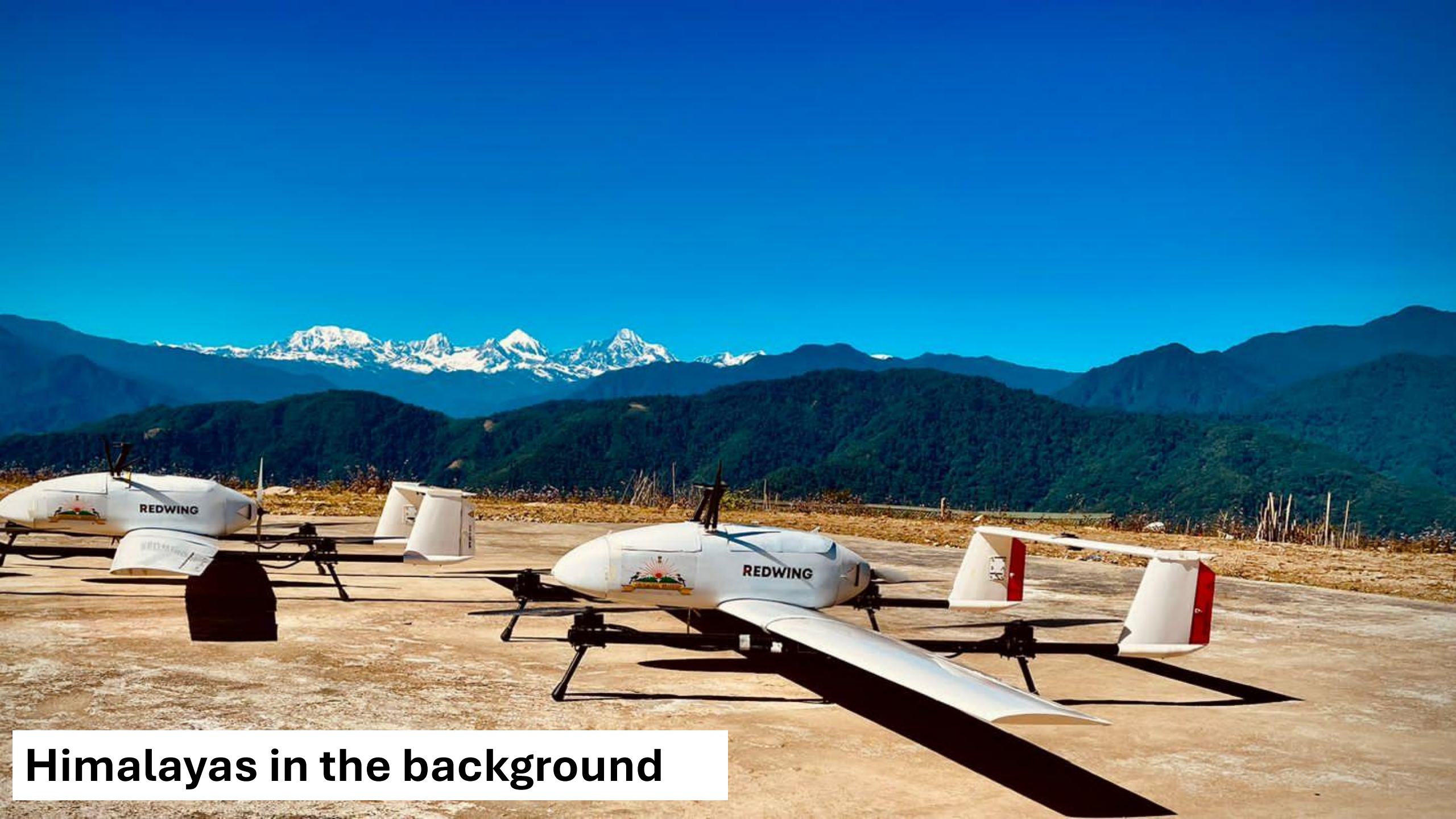
Himalayas in the background